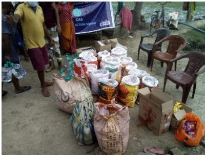
Relief Materials Supplied at Sundarbans