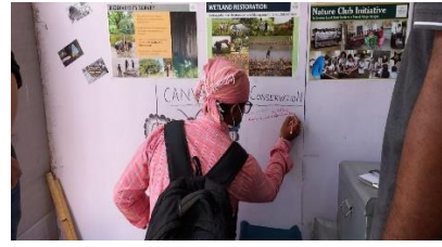
Canvas Painting at Book Fair Stall