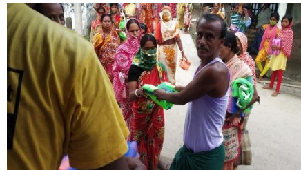
Mosquito Net Distribution at Sundarbans