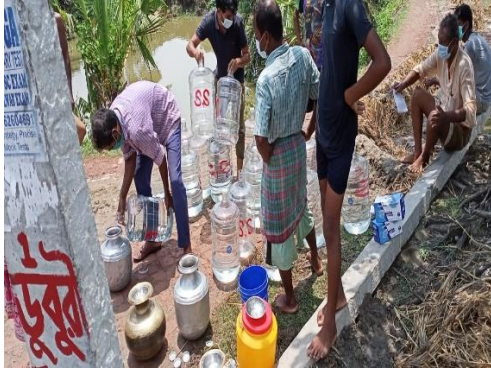
Drinking Water Supply at Sundarbans