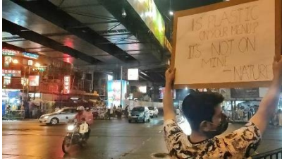
Plastic Uses awareness campaign on Streets