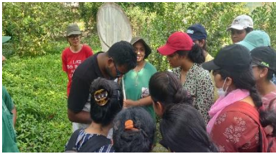
Butterfly Research & Awareness Activities