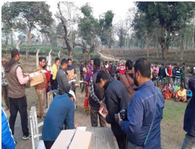
Torch Distribution: Human Elephant Conflict Mitigation