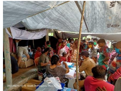
Medical Camps at Sundarbans