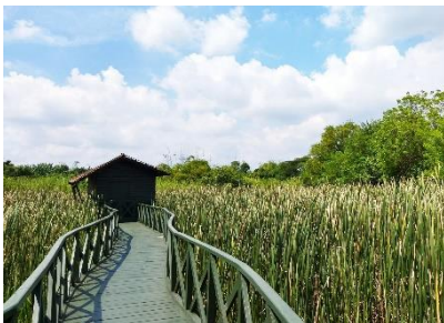
Pakhibitan: an Urban Bird Refuge