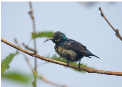
Purple Sunbird at Pakhibitan