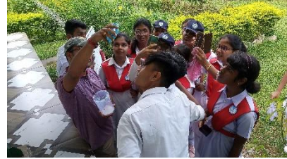
Butterfly Research & Awareness Activities