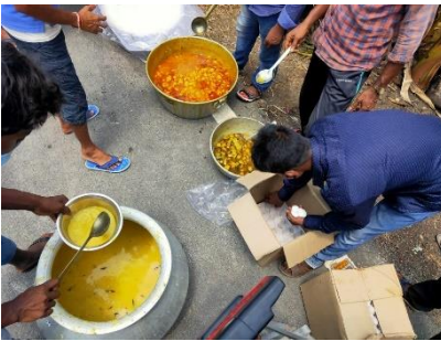
Community Kitchen: Post Cyclone Initiative