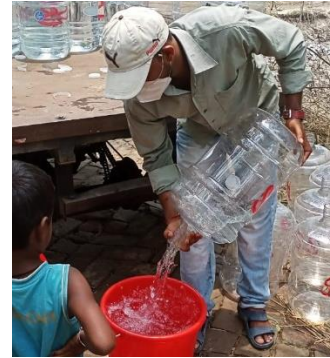
Drinking Water Supply at Sundarbans