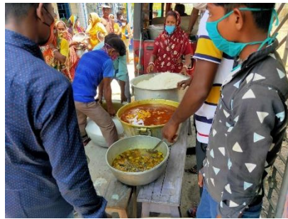
Community Kitchen: Post Cyclone Initiative