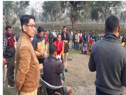
Torch Distribution: Human Elephant Conflict Mitigation