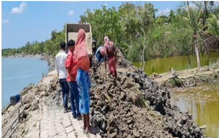
Bank Strengthening at Sundarbans